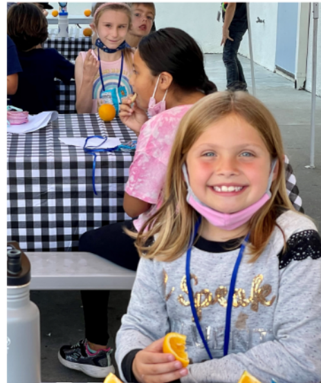
Groups like Kiwanis and Sonance grilled hotdogs and hamburgers for our Summer Members, donated and assembled craft kits, and so much more.