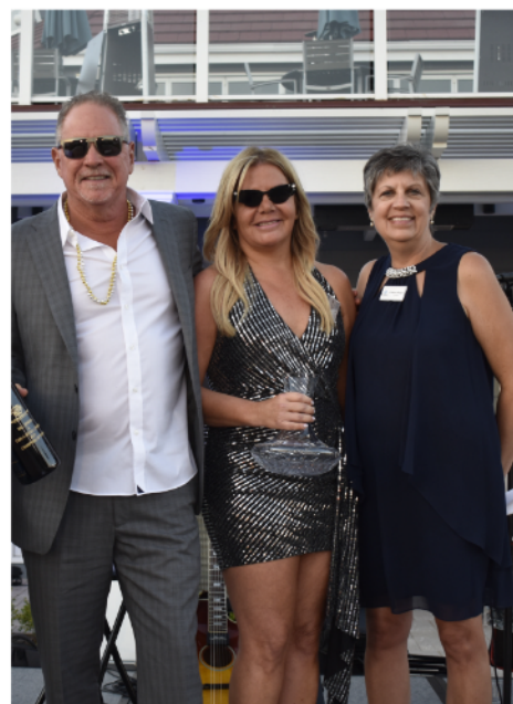
Companies like Kawasaki, Sonance, Kaiser Aluminum, Triada, and JRT Roofing & Waterproofing ensured our Driving Dreams Golf Tournament, Great Futures Gala, and Holiday Golf Classic were successful, raising over $350,000 for the benefit of our members.