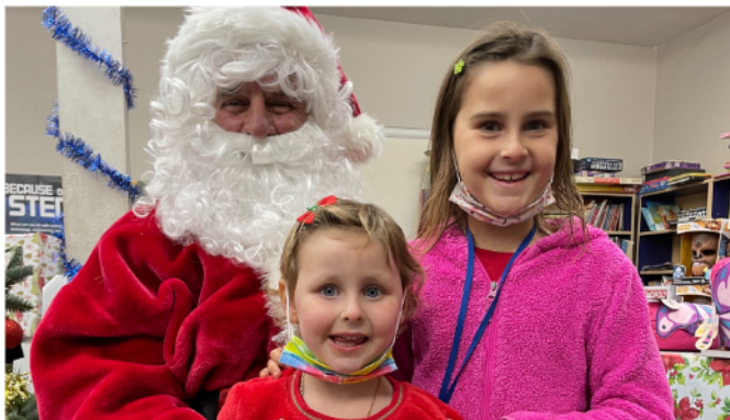
The San Clemente Junior Woman's Club's Angel Tree, San Clemente and San Clemente Sunrise Rotaries, and many more, provided holiday gifts to every member.

From our dedicated daily volunteers and our inspiring coaches, to reading tutors and event volunteers, we couldn't do what we do without YOU! We are so grateful to the individuals, organizations, and corporations that partner with us to Build Great Futures for youth in our community. We couldn't possibly recognize everyone here, so please enjoy this sampling of the incredible impact our community made together.