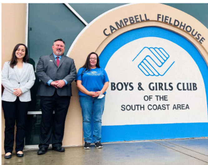
Grants and gifts from organizations like Coral Thrift, Farmers & Merchants Bank, Ford Fund and many others supported vital programs like College Bound, Brain Gain STEAM Education, and Junior Youth of the Month.